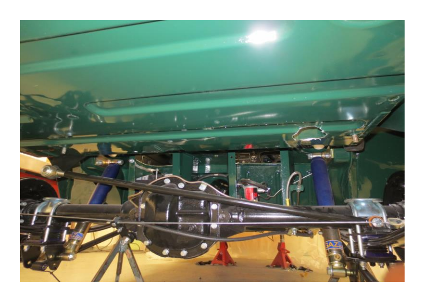
Panhard Rod Installed, on full droop

DO NOT USE THE PANHARD ROD TO CENTRE THE AXLE.